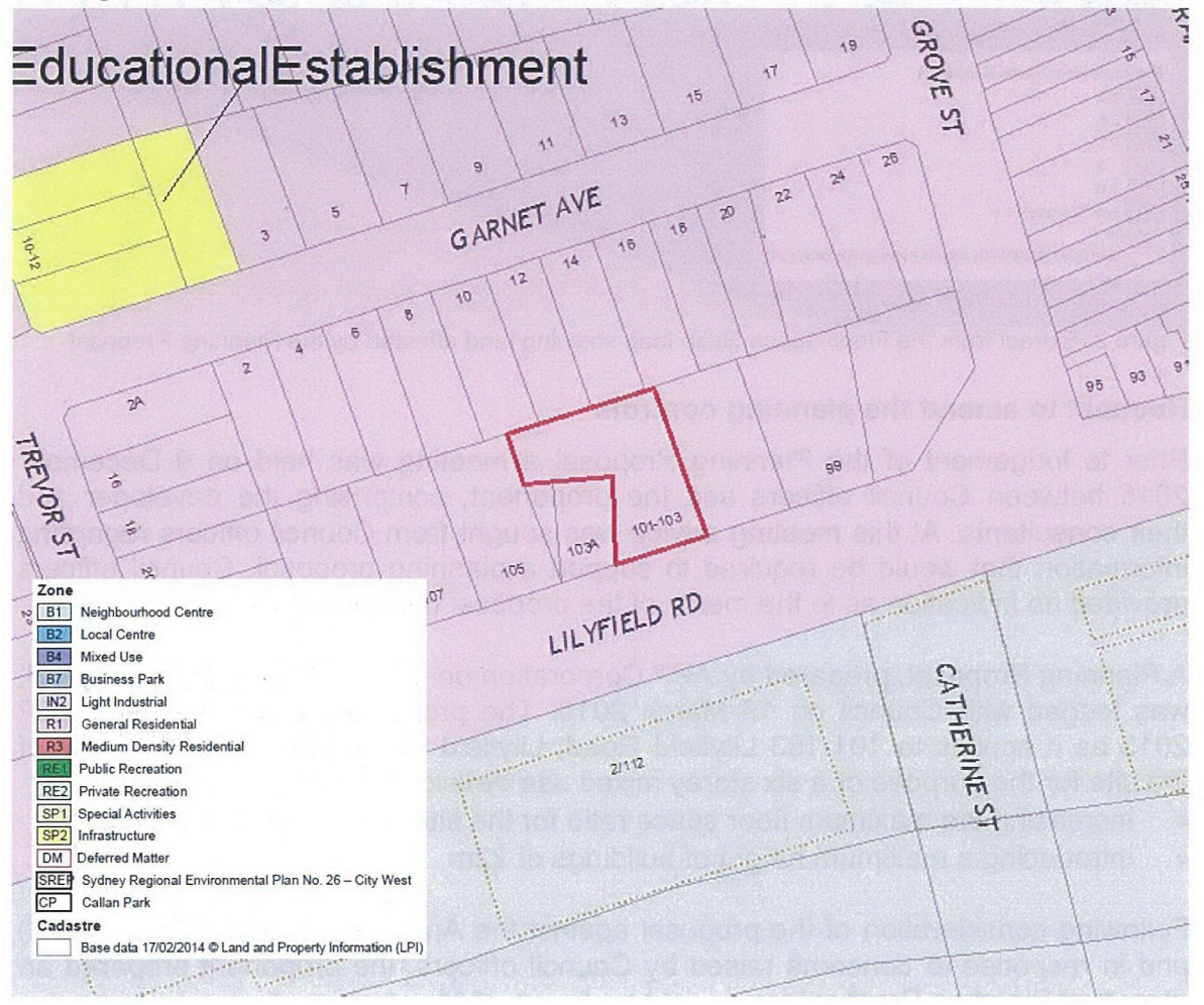
Figure 2: Extract from the Land Zoning Map showing land affected by the Planning Proposal