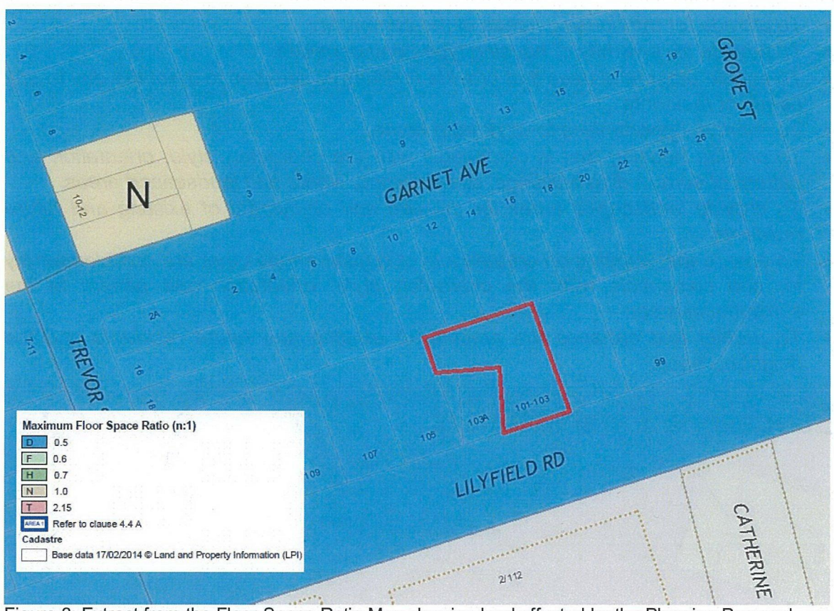
Figure 3: Extract from the Floor Space Ratio Map showing land affected by the Planning Proposal

The site has a maximum permitted floor space ratio (FSR) of 0.5:1. While there is no maximum height of building control for the site in the LEP, the Leichhardt Development Control Plan 2013 (DCP 2013) effectively controls height with the provisions for the Nanny Goat Distinctive Neighbourhood imposing a maximum building wall height of 3.6m.